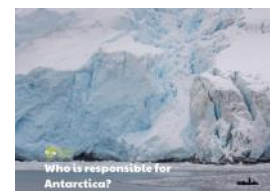
Who is responsible for Antarctica?

This week we have discussed climate change and the impact on Antarctica. We learned that if we all make little changes it will make a big difference to global warming.